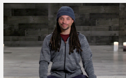
Gratitude Meditation 30 mins | ★ 4.6

Play a relaxing yoga or meditation class such as: