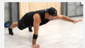
Bring It Tabata 25 mins | ★ 4.7