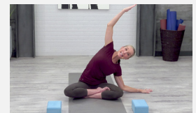
Gentle Yoga 28 mins | ★ 4.7