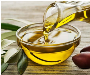
Extra virgin olive oil