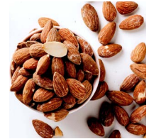
Almonds or other nuts