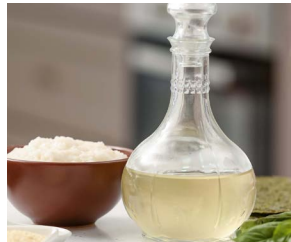
White wine vinegar