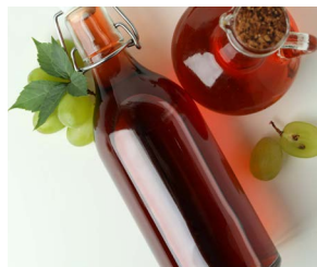
Red wine vinegar