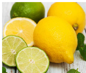
Lemon or lime juice