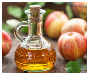
Apple cider vinegar