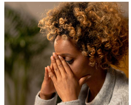
Too little rest/relaxation

Lack of whole plant foods and high-quality meats and fish.