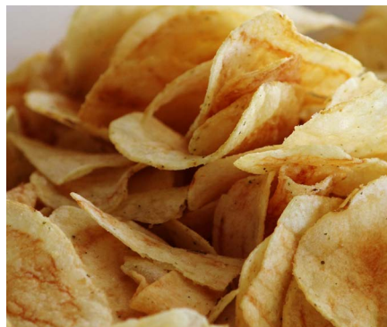
Lack of nutrients

Lack of whole plant foods and high-quality meats and fish.