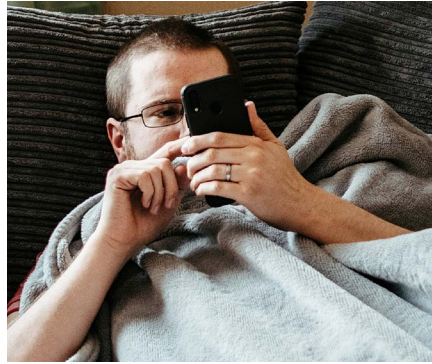
Lack of exercise