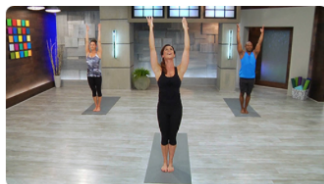
FUNdamentals 20 mins | ★ 4.5 (4730)