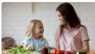
Get Kids Interested in Nutrition 6 mins | ★ 4.7 (142)

Looking for some classes to do with others? Below we have compiled a few just for you: