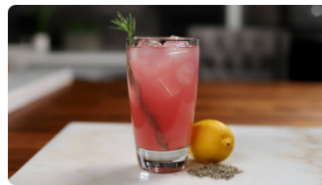
Lavender Lemonade 2 mins | ★ 4.6 (412)